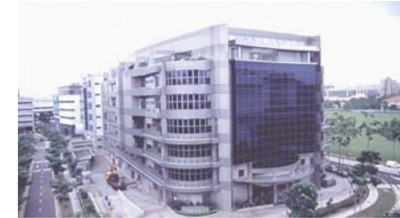
E-Secure Corporate HQ Singapore

Recognised by systems integrators, solution providers, end-users because e-secure provides the most flexible, scalable, software's for managing identities in Border Control Environments, Civil Identity Applications and Employee Credentialing Solutions.